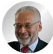
Dr. Erhard Busek Vice Chancellor a.D. Republic of Austria