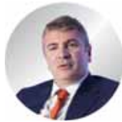
Damian Gjknuri Minister of Energy and Industry of Albania