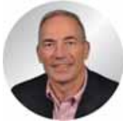
Roderic van Voorst DG ENERGY European Commission