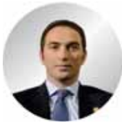
Blerand Stavileci Minister of Economic Development of Kosovo